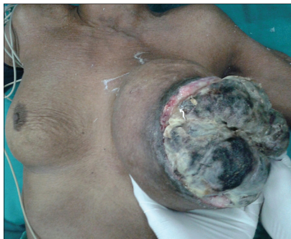
Figure 1: Gross appearance of fungating phyllodes tumour of left breast

On follow-up, patient's recovery was uneventful and wound was healthy. Histopathology report revealed borderline phyllodes tumor [Figures 2a and b]. Hence, considering patient's age and tissue report, she was advised regular follow-up and observation. Subsequent follow-ups for 1 year were uneventful.